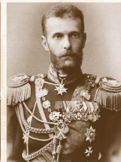
Grand Duke Sergei Alexandrovich Romanov, first Chairman of the IOPS 1889-1905