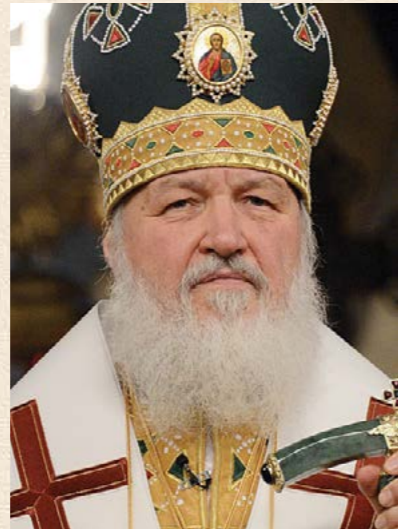
Patriarch Kirill of Moscow and All Rus', Chairman of the Committee of Honourable Members of the IOPS