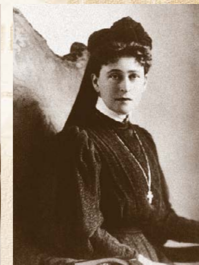
Grand Duchess Elizabeth Feodorovna Romanova, second Chairman of the IOPS 1905-1917