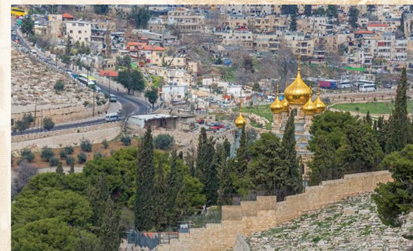
Church of Saint Mary Magdalene built in Jerusalem using funds provided by the Romanov Imperial Family

Because under Turkish law, the Palestine Society was not allowed to own property in the East (legal entities such as societies and institutions could not own land), a third of the land plots were held by the Russian Government, with the remainder held as private property. Long term plans included securing the correct recording of ownership of the Society's properties from the Ottoman Government but these ambitions were thwarted by World War 1 and the revolution, which struck a blow to the expanding Russian humanitarian efforts in the Middle East.