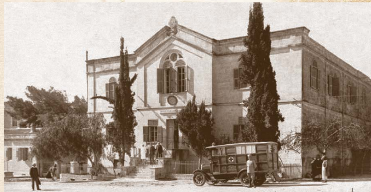
Russian hospital in the centre of western Jerusalem built during the construction of Russian buildings at the Meidan Square by the Palestine Committee between 1859 and 1864