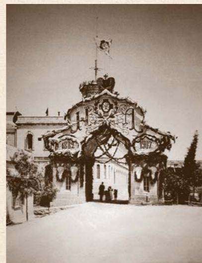
IOPS Flag and festive monogram to Emperor Nicholas II to commemorate the 25 th anniversary of IOPS in Jerusalem in 1907.

Through its successful construction and archaeological projects, the Society rapidly gained public and state recognition. Supreme Decree of 24 March 1889, granted the Society full authority, assets and funds related to Russia's presence in the Holy Land and the honorary title of the Imperial Orthodox Palestine Society.