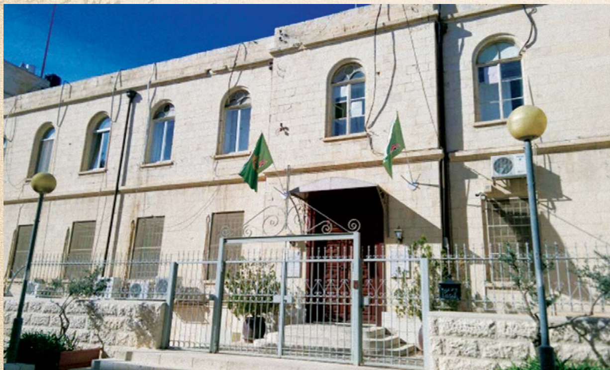
Russian Orthodox Ecclesiastical Mission in Jerusalem. Modern image