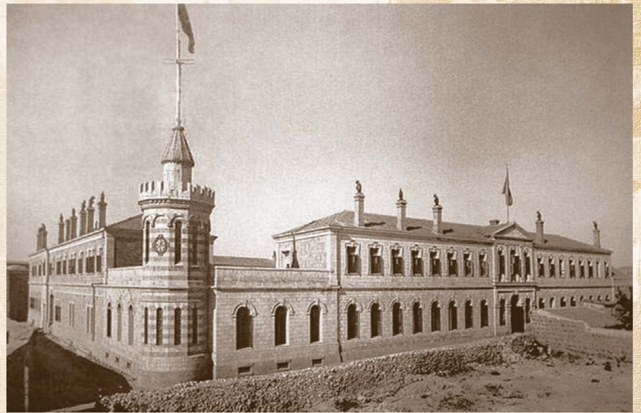
Sergievskoe compound in Jerusalem flying the IOPS Flag in 1889.

The historic document which returned the Sergievskoe compound in Jerusalem, a crucial piece of Russian property in Israel, to Russia was signed in December 2008. Reconstruction of the building has recently been completed, with the official opening scheduled for 18 July 2017, the saint day of Sergius of Radonezh. The building will be used for the same purposes as in the days of Grand Duke Sergei Alexandrovich. This includes the opening of a pilgrimage centre, hotel, refectory, museum, exhibition halls, as well as a unique archive which was assembled with great difficulty, and many other plans.