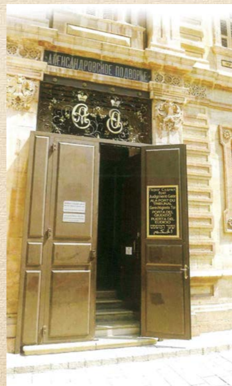
Main entrance of the Alexandrovskoe compound in Jerusalem. Modern image

In the process of collaboration with the councils of Jerusalem, Nazareth and Haifa, strong working relationships have been established which support continued cooperation between Russia and Israel.