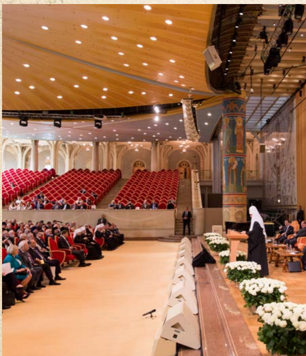
The 4th Report-and-Election Conference of the Imperial Orthodox Palestine Society timed to coincide with the IOPS' 135th anniversary was held at the Cathedral of Christ the Saviour. June 2017