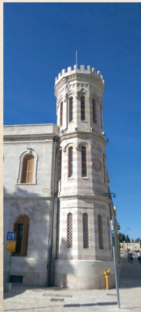
Corner tower of the Sergievskoe compound in Jerusalem. Modern image