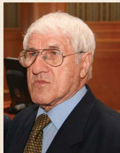
Oleg Peresyphkin, Chairman of the IOPS from 1989 until 2001

The creation of Israel in 1948 made the return of Russian property a relevant and convenient point for a Soviet-Israeli understanding. On 25 September 1950, the Council of Ministers of the USSR issued instructions to recommence operation of the Palestine Society and approve the staff of its Israel chapter.