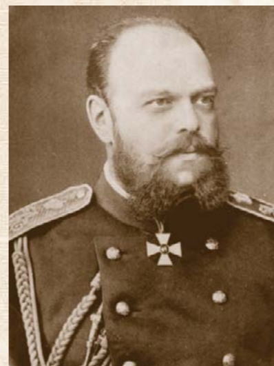
Russian Emperor Alexander III, who approved the Charter of the IOPS on 3 June 1882