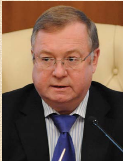
Sergey Stepashin, Current Chairman of the IOPS