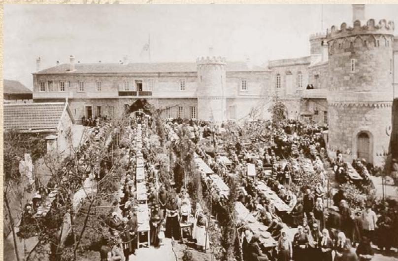
Easter breaking of the fast in the yard of the Sergievskoe compound of the IOPS in Jerusalem Late 19 th century