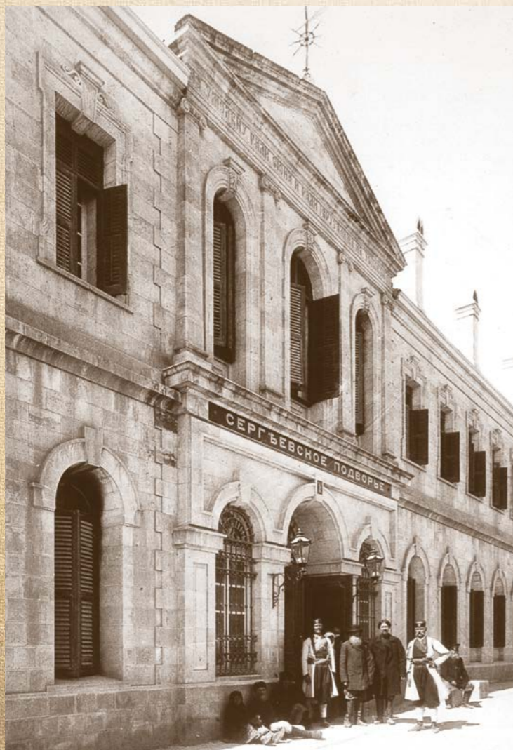
Pilgrims by the main entrance of the Sergievskoe compound.

Named after the founder and first Chairman of the Palestine Society, Grand Duke Sergei Alexandrovich, the compound combines not only the history of the Society which built it and the multifaceted Russian heritage in the Holy Land, but also that of Imperial Russia.