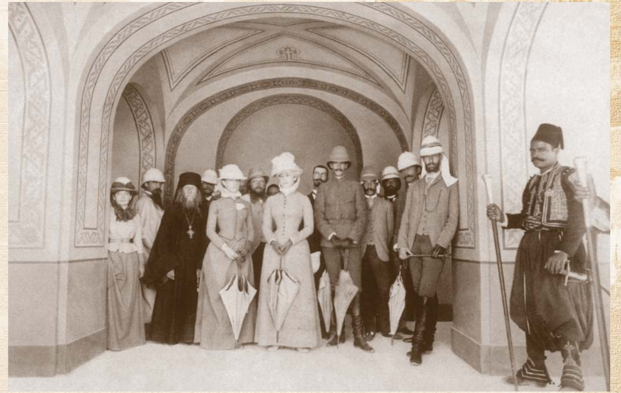
Grand Dukes Sergei Alexandrovich, Pavel Alexandrovich and the Grand Duchess Elizabeth Feodorovna on pilgrimage in Jerusalem in 1888.