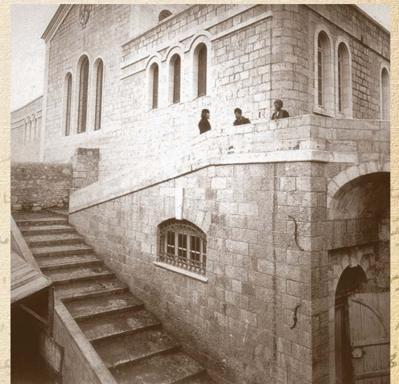
Church in the Alexandrovskoe compound in Jerusalem from the front. Early 20th century